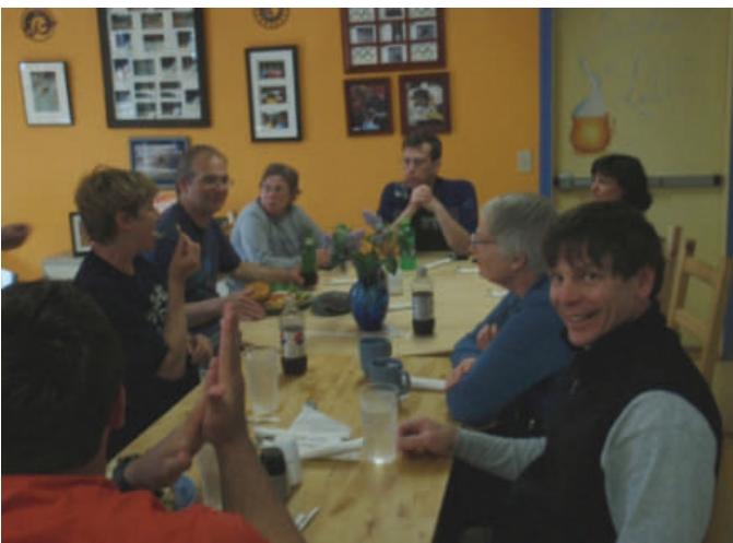
After trip meal at the Lucky Dog Café.

After the trip everyone met at the Lucky Dog for a post trip meal.